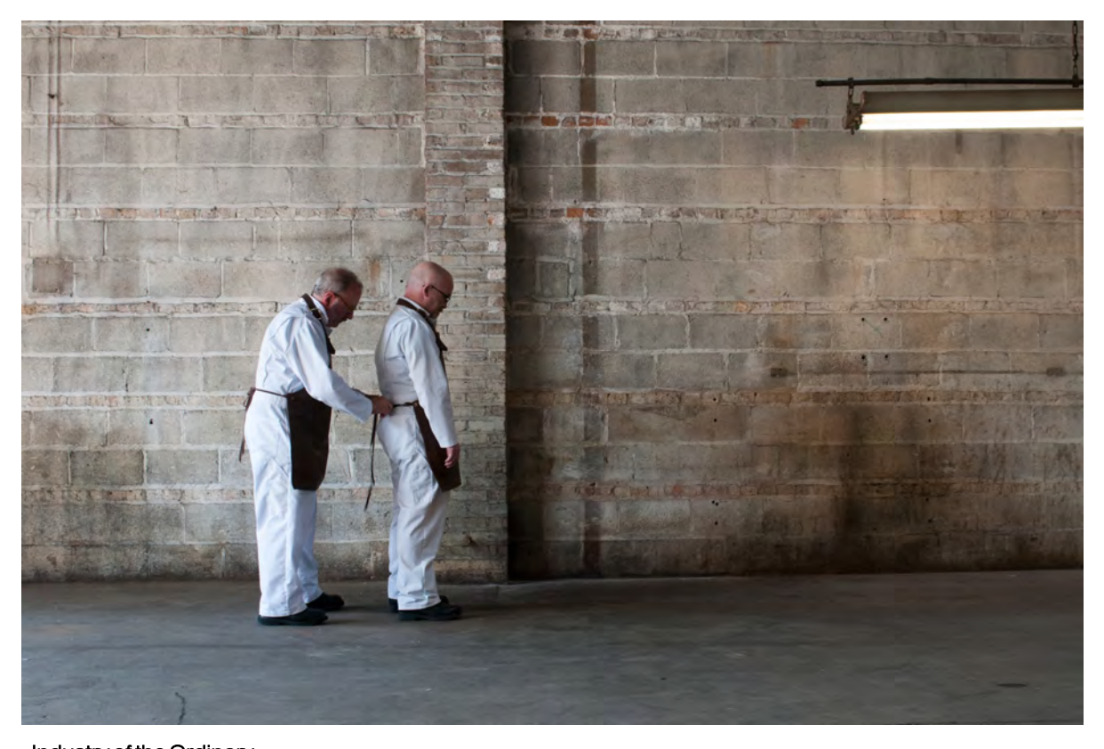
Industry of the Ordinary History and Forgetting, performance. Sept 16th, 2017 at Silent Funny, Chicago.

yet be realized but for a different audience.