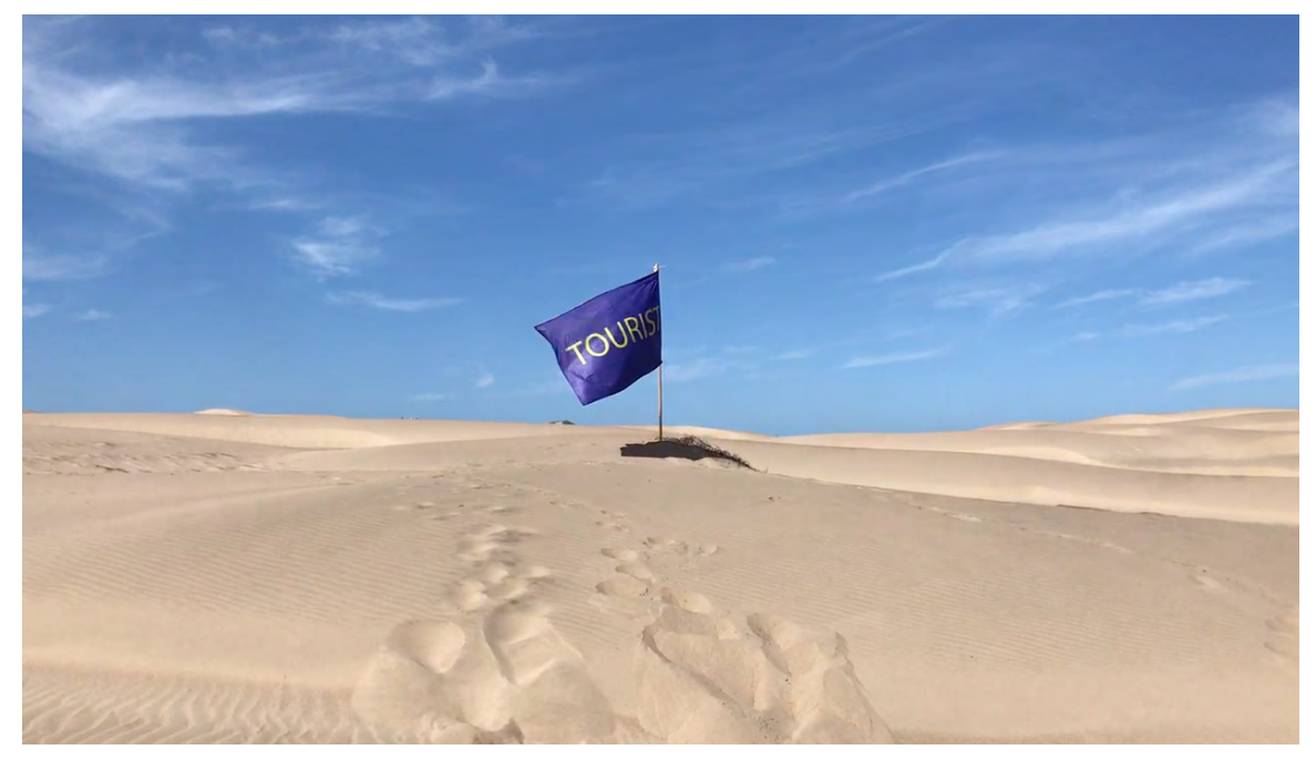
Industry of the Ordinary Tourist, Trader, Refugee, video still. 2018.

G.A.: In your opinion, what is the role of 'forgetting' in American history and is there a specific dimension to American 'forgetting' that seems different to you from that of other countries?