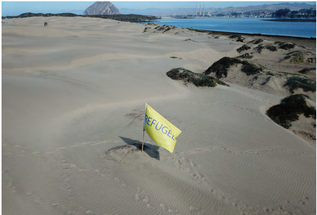
Industry of the Ordinary Tourist, Trader, Refugee, video still. 2018.