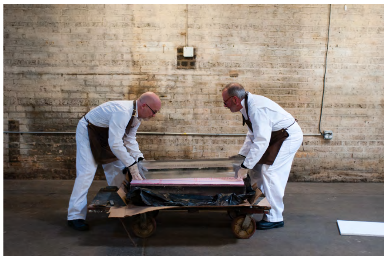
Industry of the Ordinary History and Forgetting, performance. Sept 16th, 2017 at Silent Funny, Chicago.

We were struck in the production of the work by the generational gap revealed in attitudes to Europe in the Leave vote and a belief in some quarters that England (in particular) could return to the halcyon days of their youth.