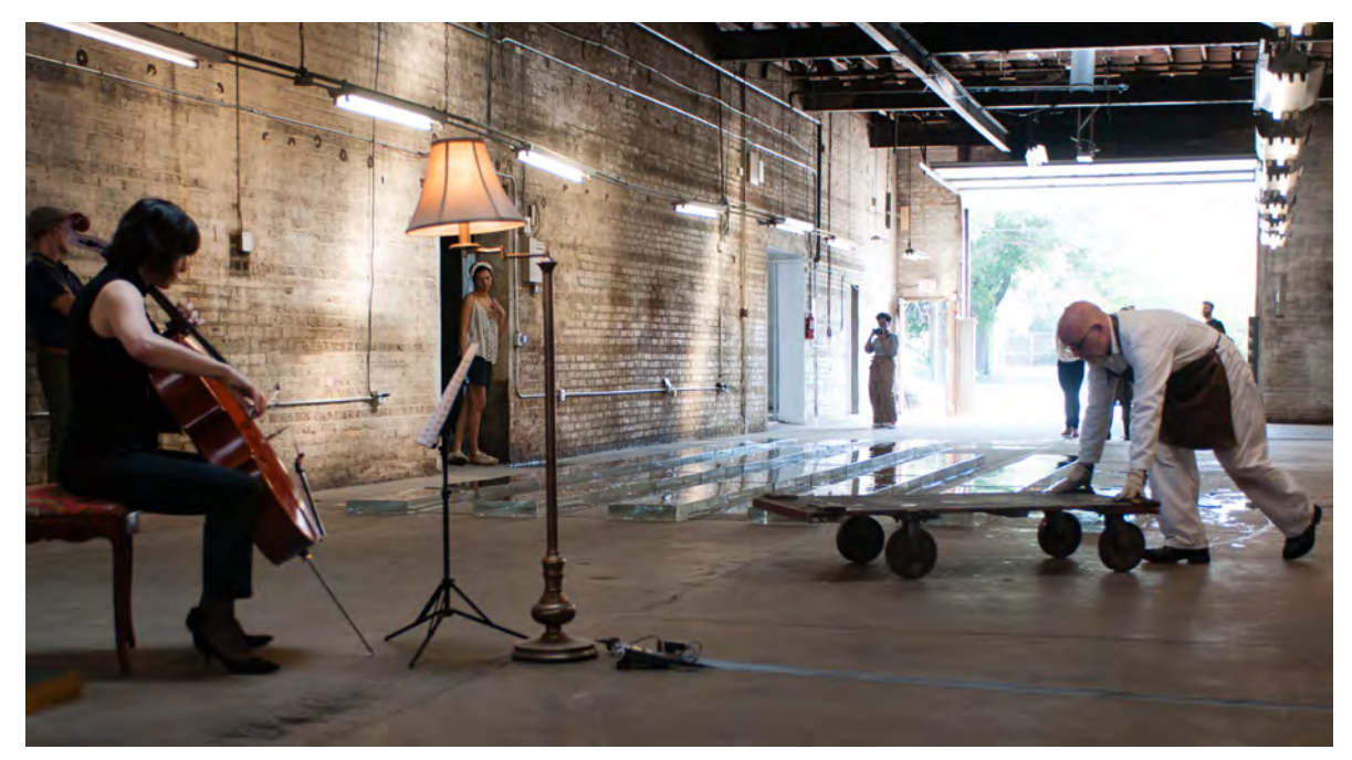
Industry of the Ordinary History and Forgetting, performance. Sept 16th, 2017 at Silent Funny, Chicago.