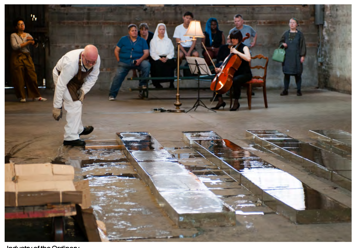
Industry of the Ordinary History and Forgetting, performance. Sept 16th, 2017 at Silent Funny, Chicago.

climate change and the institutionalisation of climate denial - and the NFL protests over police brutality and the subsequent attempt in right-wing media to shift the target of those protests to the flag, patriotism and the military.