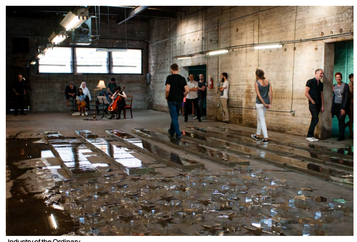
Industry of the Ordinary History and Forgetting, performance. Sept 16th, 2017 at Silent Funny, Chicago. Photo: Andrea Bauer © Industry of the Ordinary