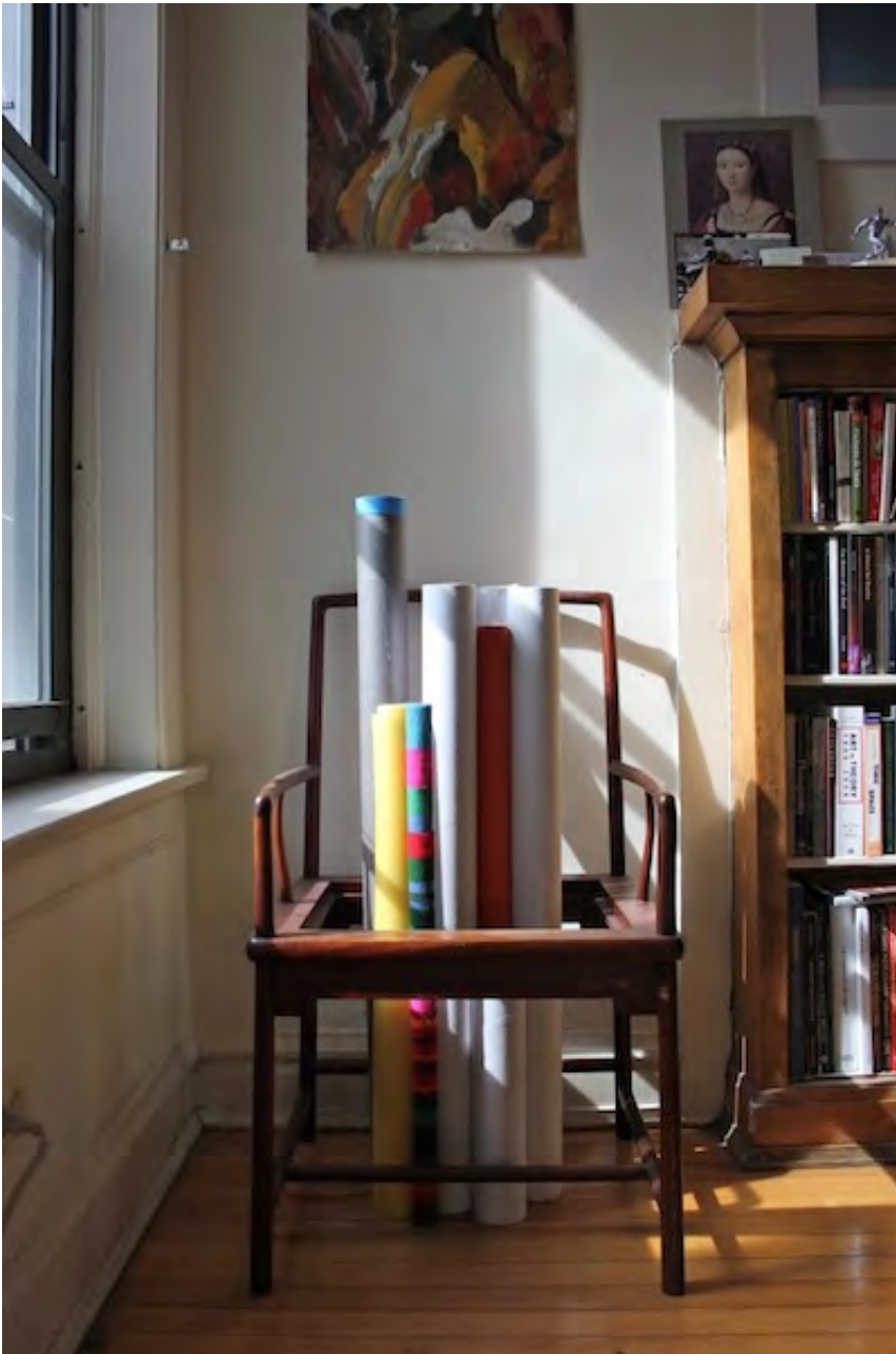
Alberto Aguilar, Photo Tubes (Rachel Herman), 2012, from the ‘domestic monuments’ series, installation view